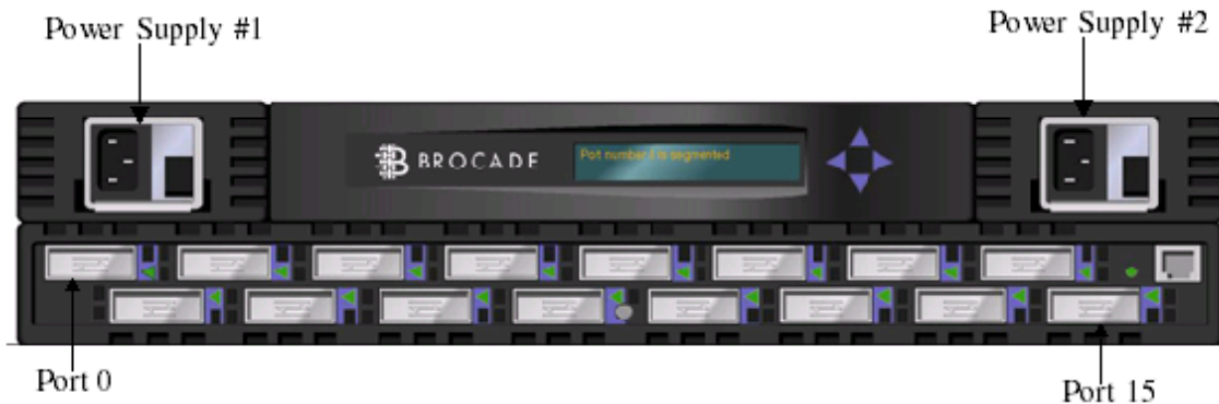
Figure 1-1 on page 1-1 of the SilkWorm 2800 Hardware Reference Manual has mislabeled callouts. The power supplies 1 and 2 are reversed and should be labeled as follows: