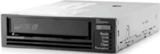
HPE StoreEver LTO Ultrium External Tape Drive