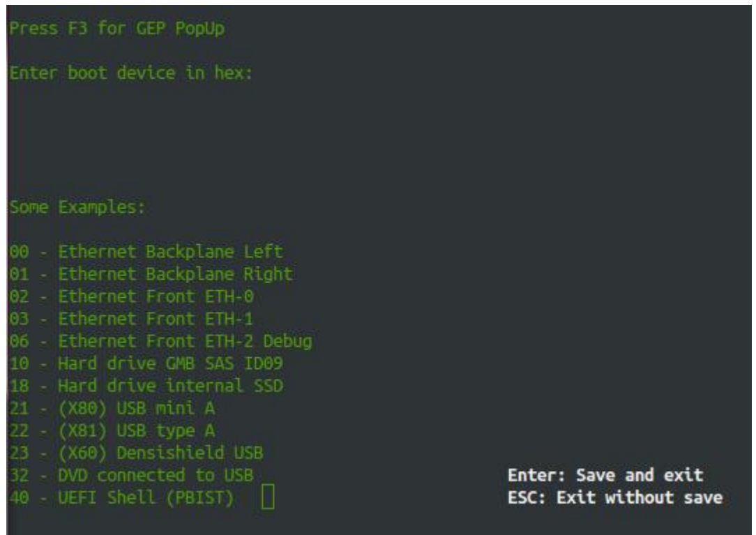
Figure 7 GEP5 PBIST Menu