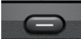
N70 'Home' / 'Touch Screen Lock' button