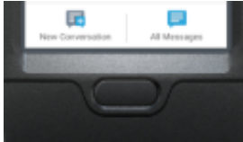
APX NEXT 'Home' / 'Touch Screen Lock' button