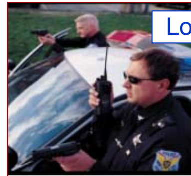
Local Public Safety