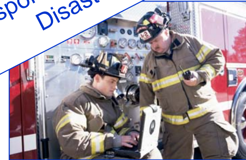
Response to Natural Disaster