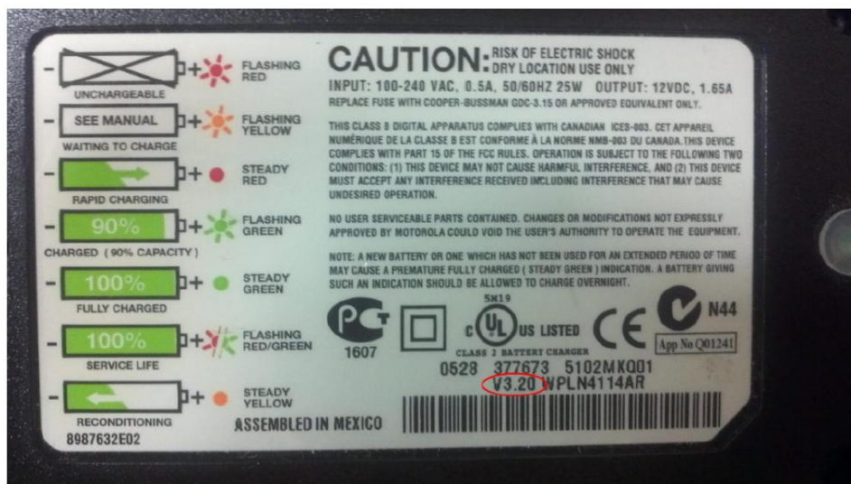
Figure 2: XTS Single Unit charger